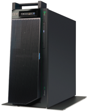
IBM Power 720 Express (tower)

The IBM i Solution Edition hardware for Help/Systems is based on the latest generation of POWER7 systems from IBM, a powerful, scalable, 64-bit computing platform. You can order rack-mounted or desk-side models of the 4-, 6-, or 8-core IBM Power 720 Express systems, and IBM Power 740 Express systems with as many as 16 cores, and enjoy all the IBM Solution Edition discounts (see the Benefits of the IBM i Solution Edition for Help/Systems insert).