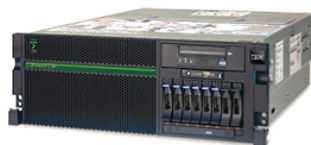
IBM Power 740 Express (rack-mount)

IBM i Solution Editions help businesses take advantage of the experience and expertise of IBM and its ISVs to build business value in IT investments. Each Solution Edition provides an affordable, simplified, easy-to-manage, high-performance IT environment for core business applications.